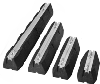
Supports sol caoutchouc