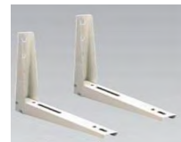
Supports muraux. Charge de 80 à 140kg