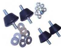
Amortisseurs de vibration