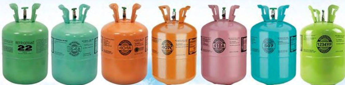
R22, R410a, R407c, R136a, R600a, R32, R404a, R507, MACC GAZ